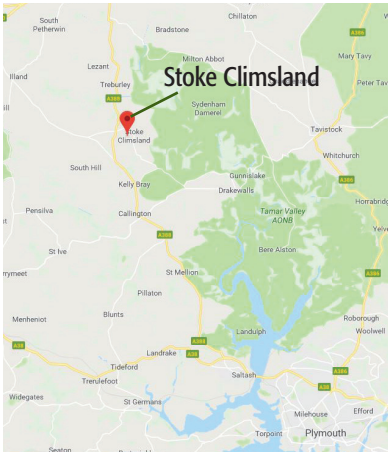
Map data © Google 2018

Online directions: https://www.duchy.ac.uk/location-pages//stoke-campus.html